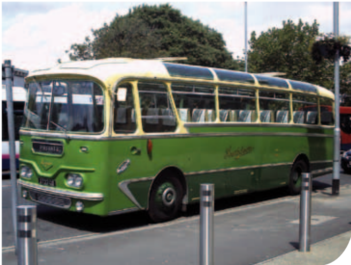
1961, Southdown Motor Services Coach and delegates on the journey